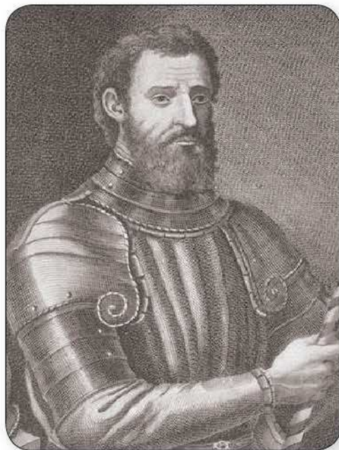
Giovanni da Verrazzano